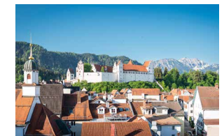
"Hohes Schloss" Füssen